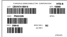
F63TNR Label sample