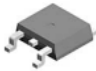
Plastic Package TO-220